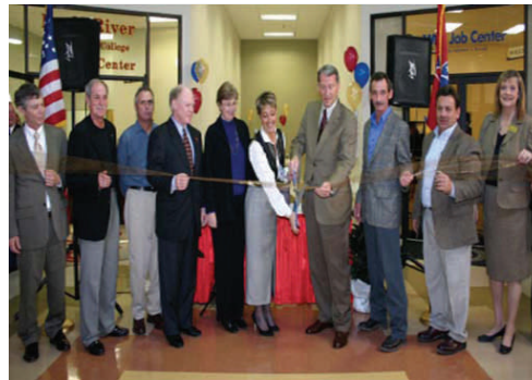
Ribbon cutting Hancock Center

students. As the population returns to Hancock County after Hurricane Katrina, it is