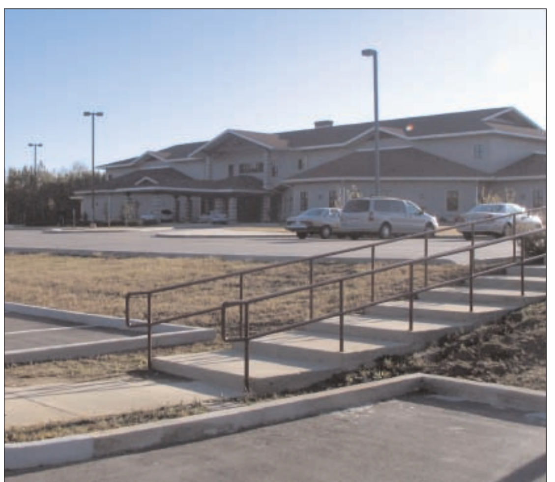
The Lowery Woodall Advanced Technology Center in Hattiesburg.

uring training to the manufacturing sector in the local area.