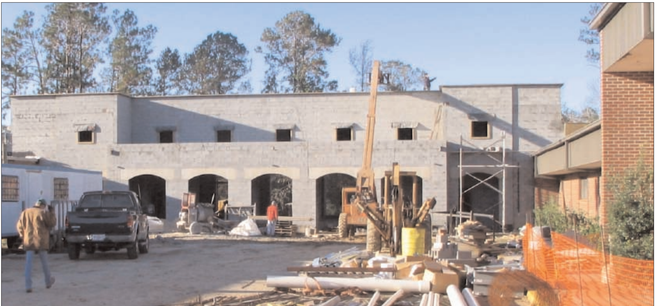
Despite Hurricane Katrina's interruption, construction continues on the new building at the Forrest County Center in Hattiesburg. The 12,000 square-foot building across the front of the campus on U.S. 49 South will provide a new academic image to the school. New spaces include five classrooms, a learning center with 30-35 computers, new library space with two study rooms and administrative space, two new academic offices and new restrooms. The photograph above is from the back of the building. Completion of the project is expected to be sometime in late spring, 2006.