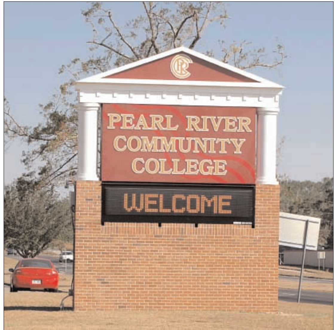
Visitors to Pearl River Community College's main campus in Poplarville (above) and Forrest County Center (below) in Hattiesburg on U.S. 49 South are now greeted by new message boards that recently became operational. The message boards will inform the public about upcoming events at the school.

LPRV is a philanthropic entity serving this region to improve the physical, mental, emotional, spiritual, and social health of the people in this area.