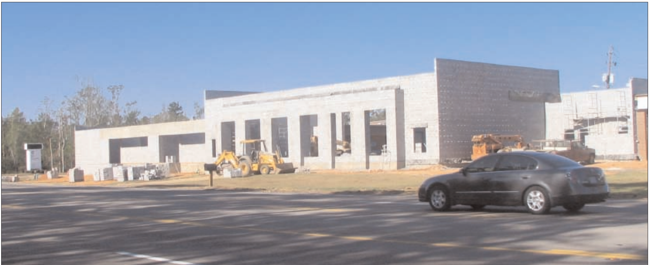
Despite Hurricane Katrina's interruption, construction continues on the new building at the Forreest County Center in Hattiesburg. The 12,000 square-foot building across the front of the campus on U.S. 49 South will provide a new academic image to the school. New spaces include five classrooms, a