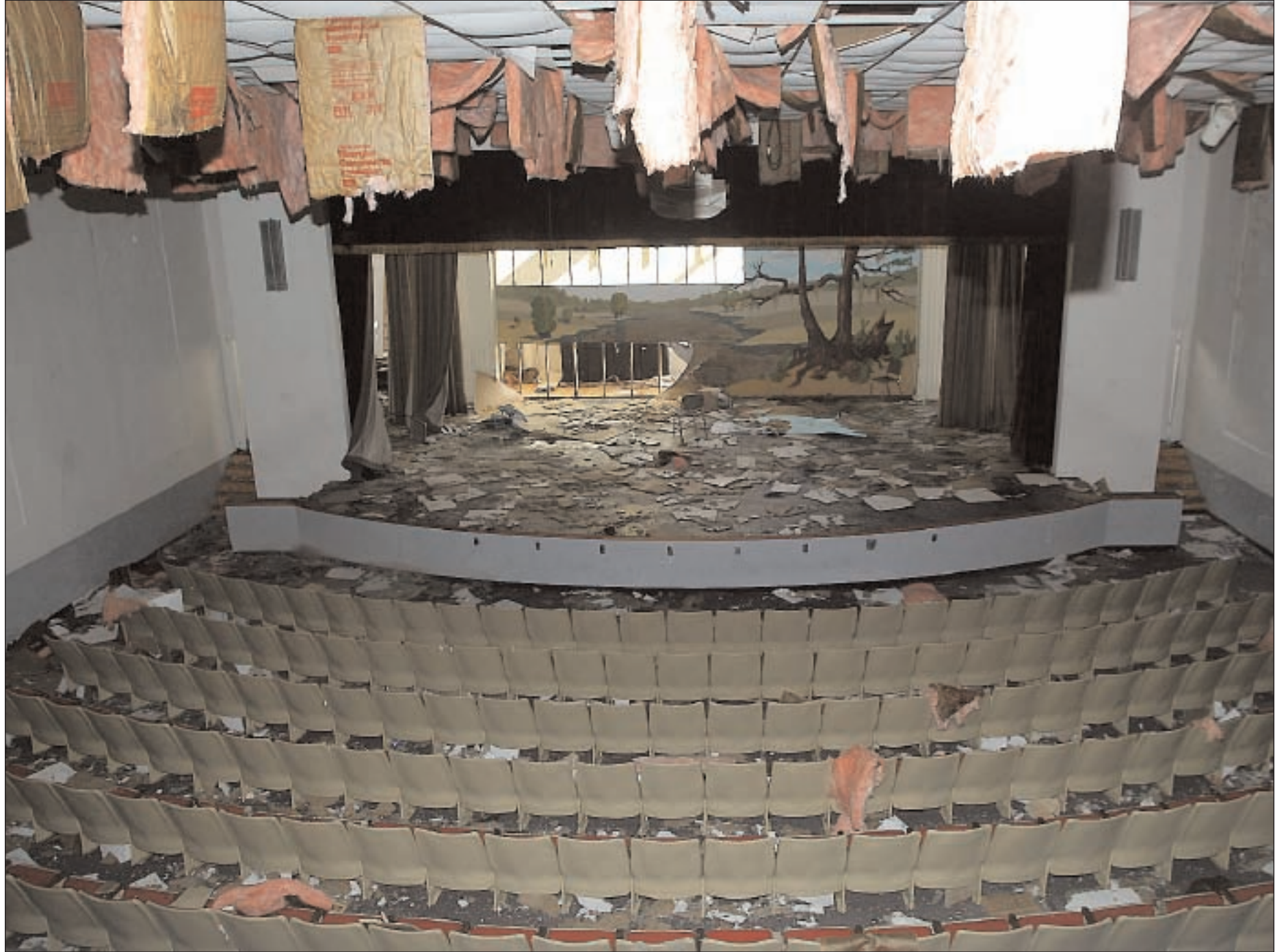
POPLARVILLE - Moody Hall, a three-story structure built in 1926 and the oldest classroom building among the state's 15 community and junior colleges, suffered heavy damage from Katrina. The auditorium roof blew off during the height of the storm, resulting in extensive interior damage from wind and rain.