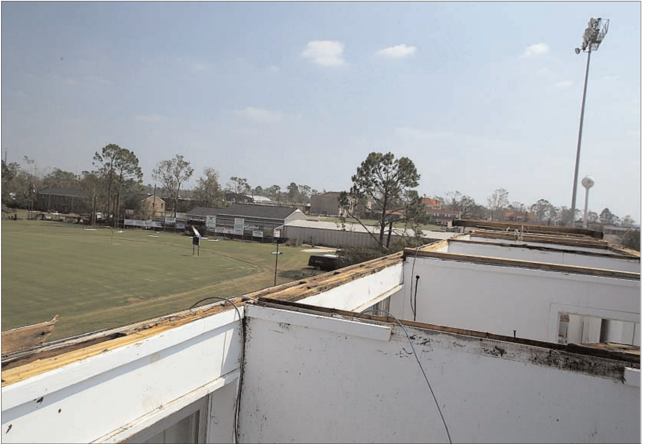
Dobie Holden Stadium, home of the Wildcats, lost its roof during the storm. The scoreboard was also damaged as was the row of billboard signs in the South end zone.