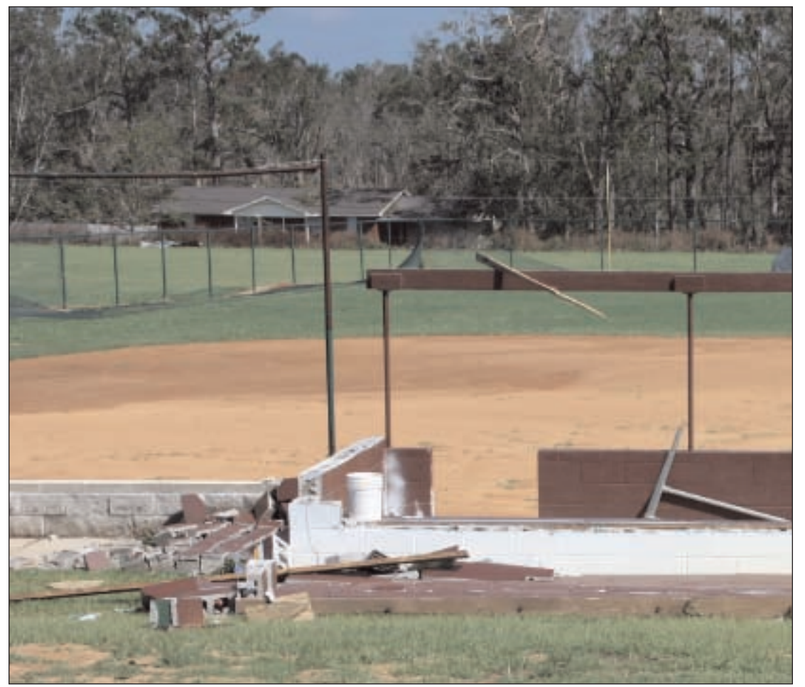
The first-baseball dugout at the Wildcat baseball field and both the dugouts on the Lady Wildcat softball field fell victim to Hurricane Katrina's 120 mile-per-hour winds that passed through Poplarville.