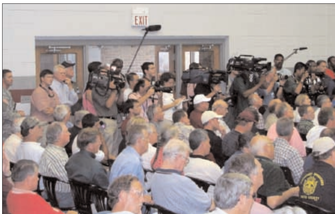
Due to limited space in the Technology Center, only a small number of local and national press were allowed to hear the president, according to a spokesman from the White House press secretary's office.