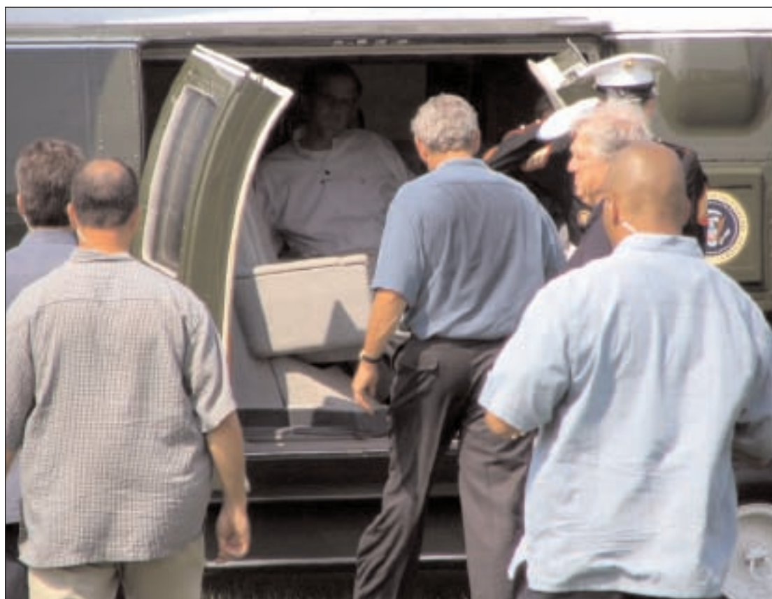
President Bush, showing the effects of a hot and humid South Mississippi day on his shirt and surrounded by Secret Service agents, boards Marine 1 for his departure from Pearl River Community College.