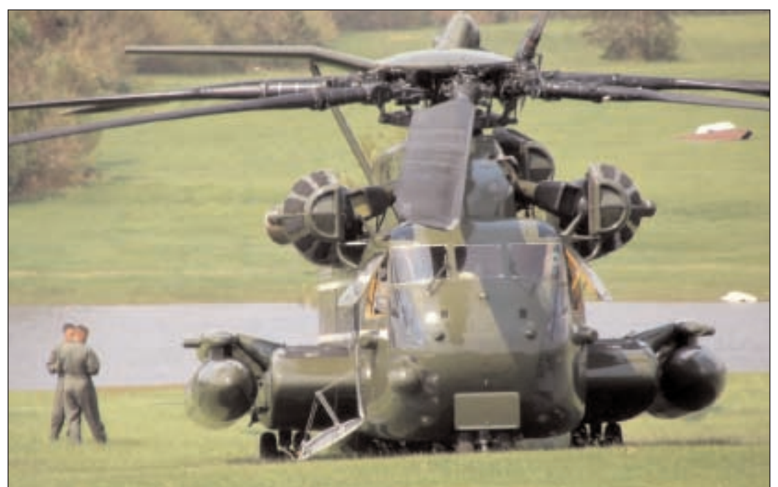
President Bush arrived at 1:30 p.m. aboard Marine 1, accompanied by a second Marine helicopter and two Black Hawk helicopters (above), which carried the press and presidential staff.