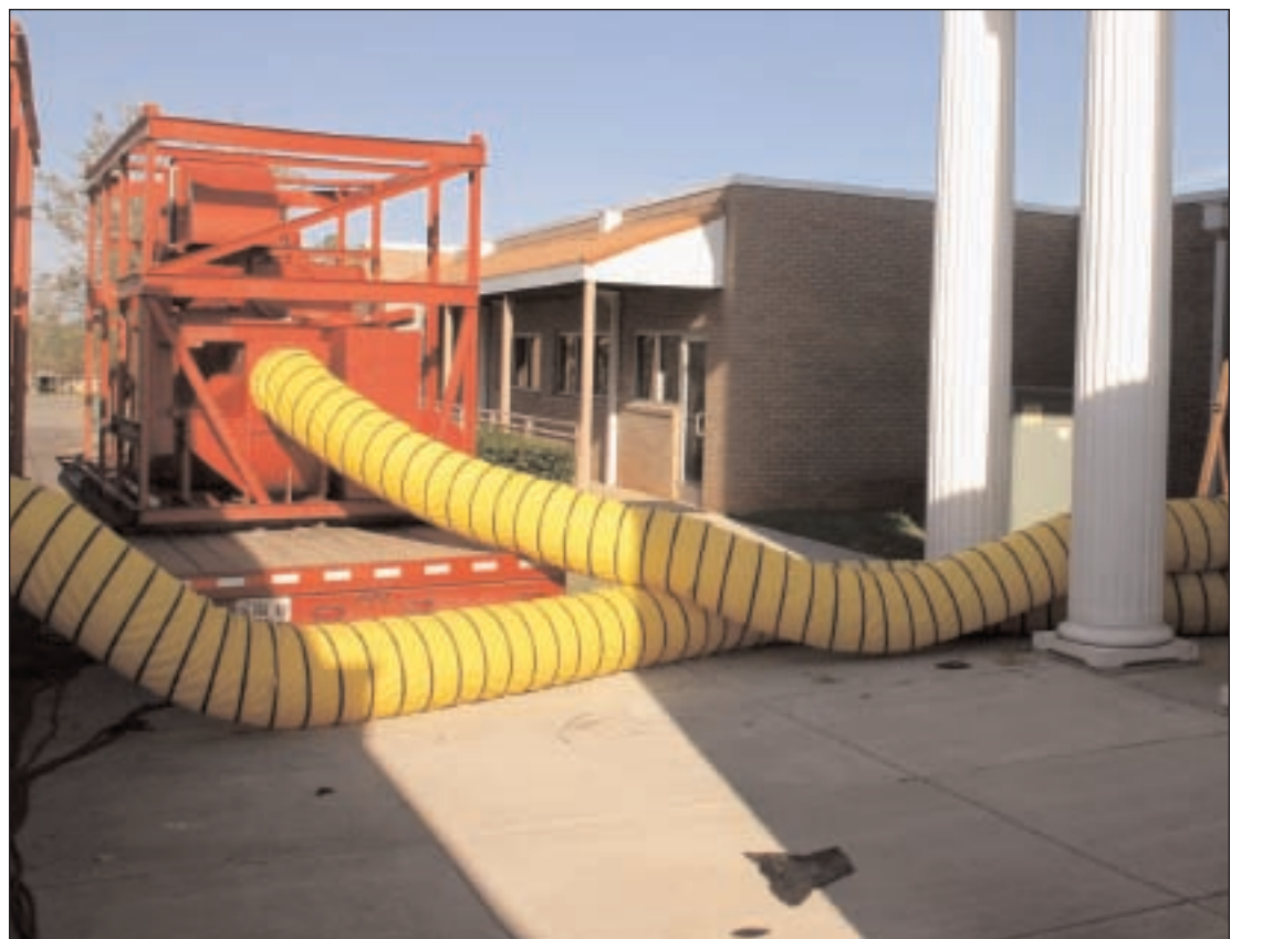
Pearl River Community College put the task of cleaning and airing out all the buildings on the Poplarville campus in the hands of Disaster Services Inc. of Atlanta, Ga.