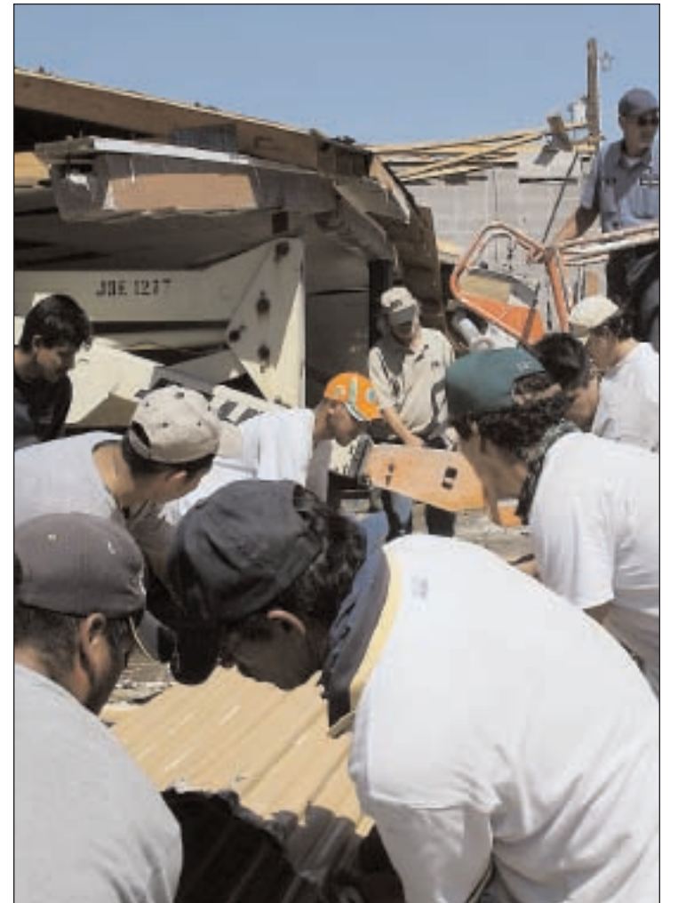
Workers take down what's left of the Vehicle Maintenance Shop, which was demolished by Hurricane Katrina.