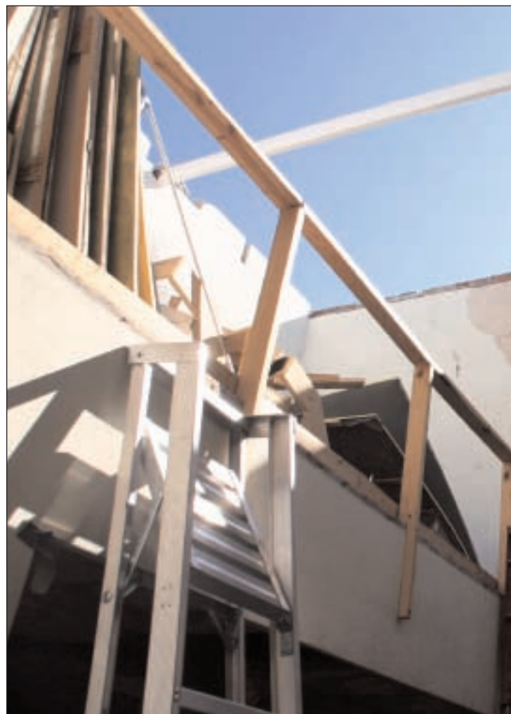
The roof at Moody Hall was not only a casualty during Hurricane Katrina but during Hurricane Camille back in 1969.