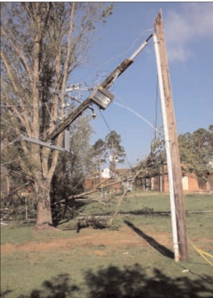
Downed power lines and poles were not just evident on the PRCC campus, but throughout all of South Mississippi.