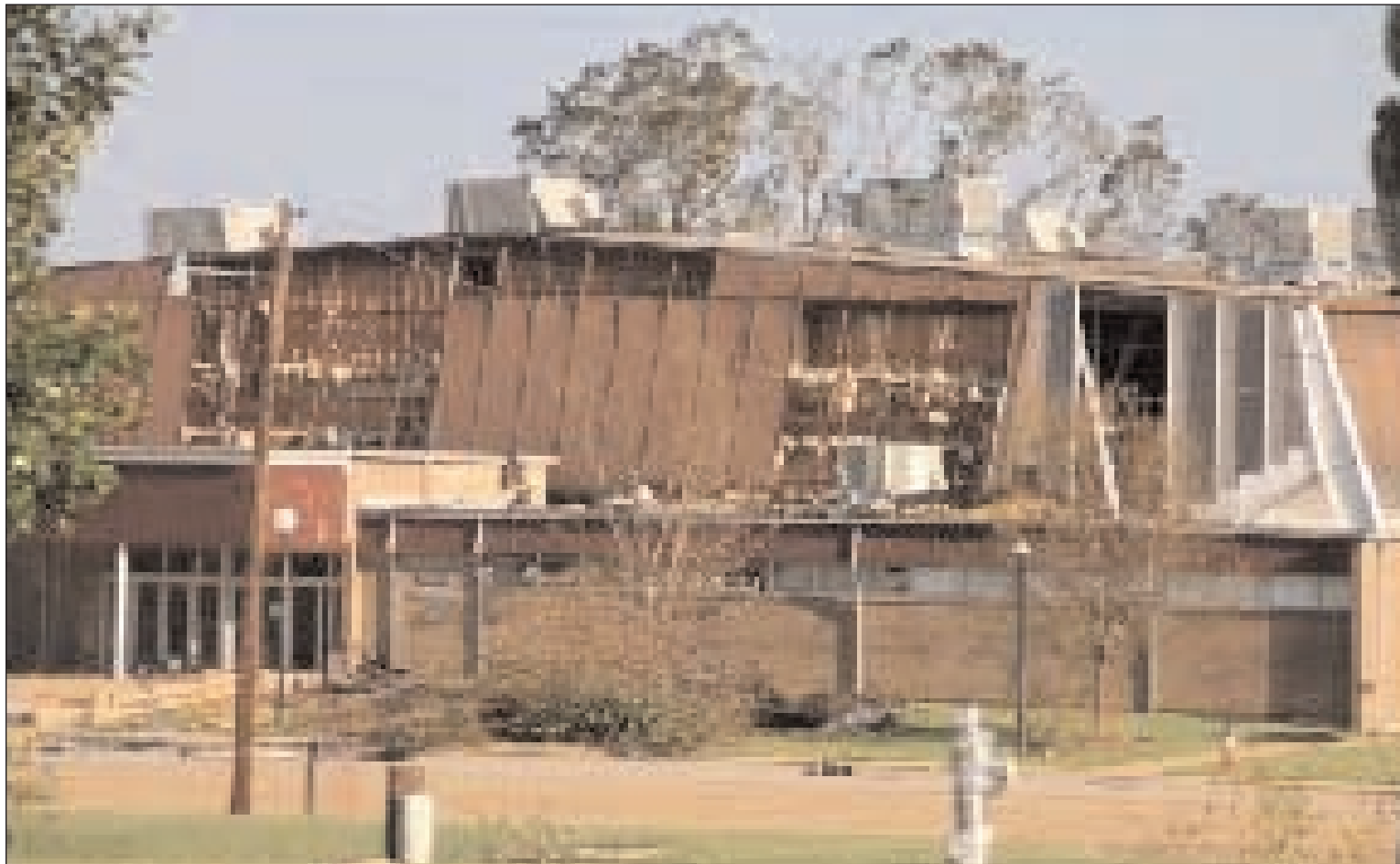
Daylight the morning after Hurricane Katrina revealed just how much damage was done to M.R. White Coliseum, home of graduation each year.