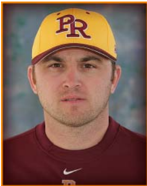
ASSISTANT HEAD COACH